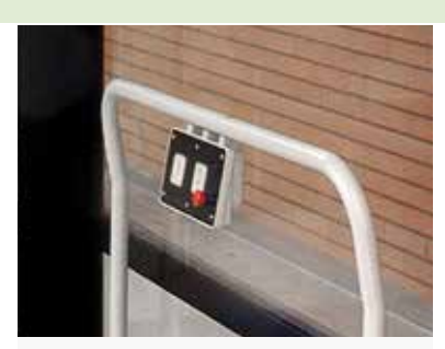
On-board control panel Steppy

the Steppy platform lift's technical and stylish features, make it a favourite among the best Italian installation engineers with hydraulic mechanics, metal or grey polycarbonate enclosure, to improve the design and the aesthetics of the lift. Vimec has designed a control on board and a landing radio control which makes the Steppy the functional leader in the market place.