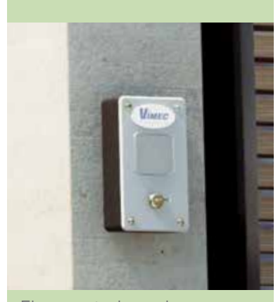
Floor control panel 50X50 mm - Silver