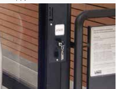
Floor control panel Steppy