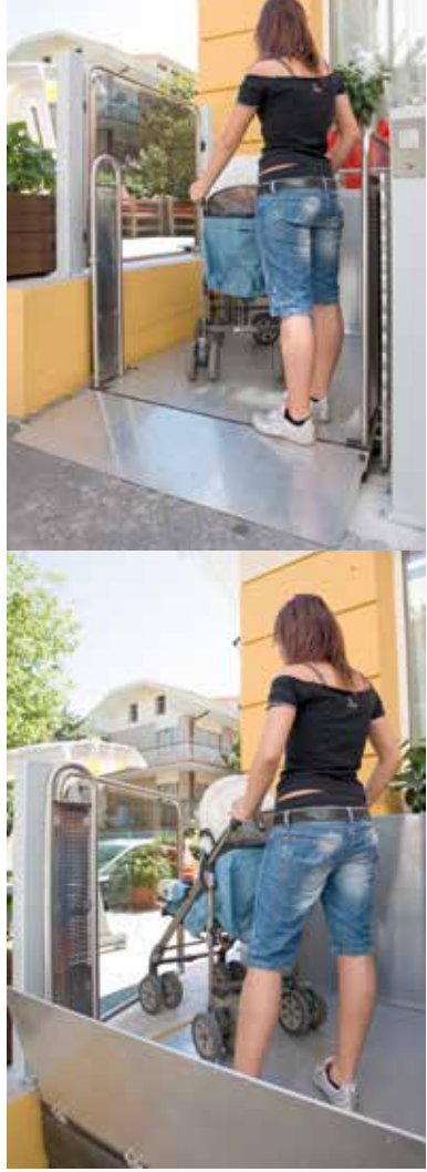
Stainless steel version with gate with grey polycarbonate and 90° landing