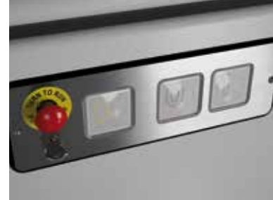
On-board control panel Silver

Standard version in RAL 7040 painted steel